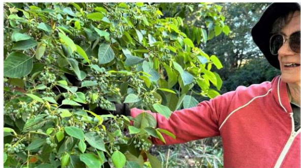
Bleeding Heart Fruit