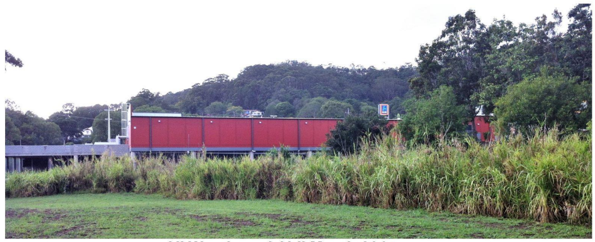
All Weeds and Aldi March 2014

Just a part of the magic created by this keen group of enthusiasts.